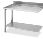
WTX51200L Exit table left side 1200mm