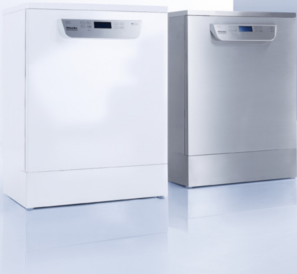
Illustration shows the new dishwashers models with a variety of features Features may vary depending on the model