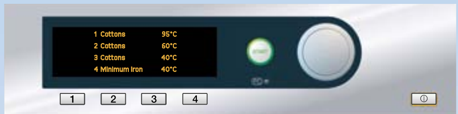
Programme selection concept: Direct-access buttons