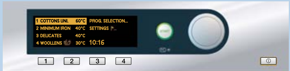
Programme selection concept: Standard