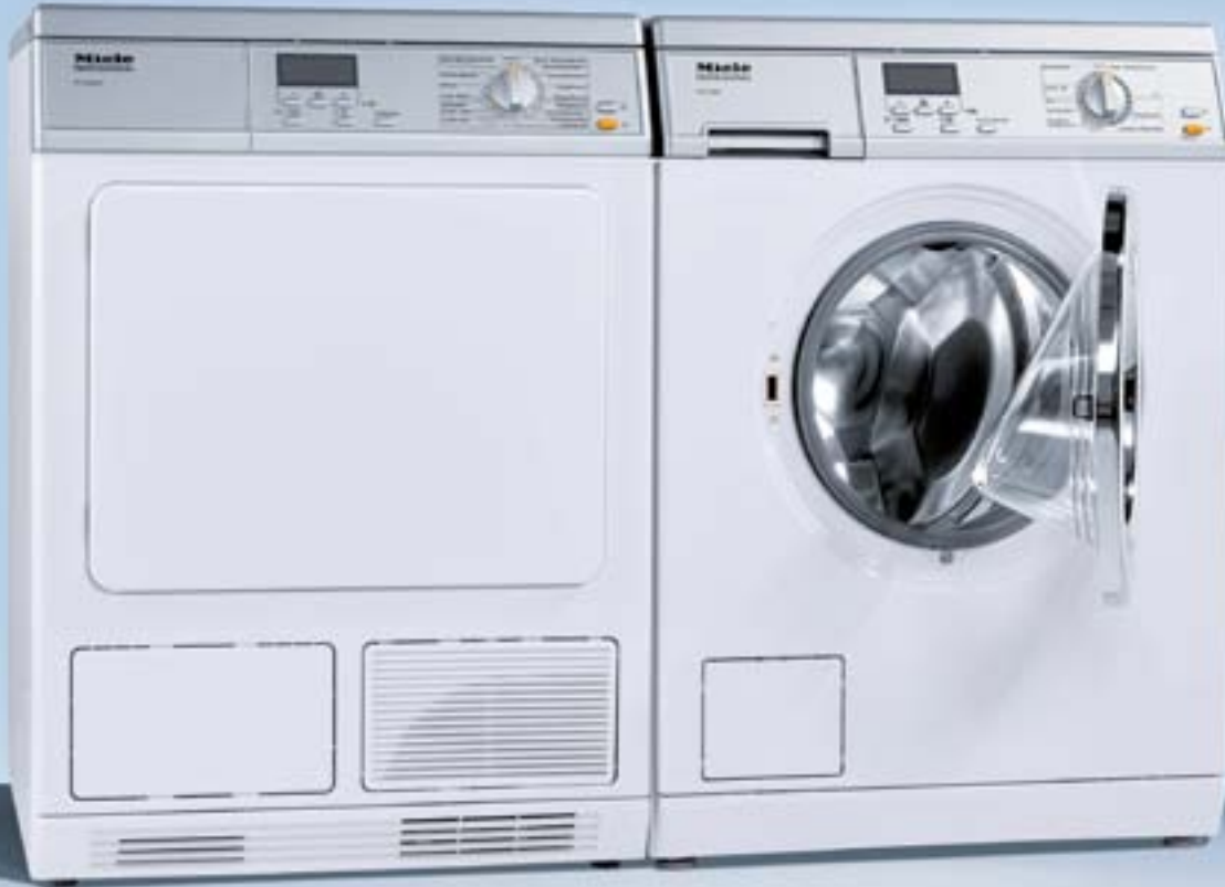
Illustration shows PW 5062 with PT 5135 C