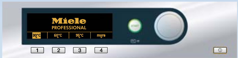
Programme selection concept: Direct-access buttons and more

Illustration shows Profitronic L Vario controls from the Octoplus range