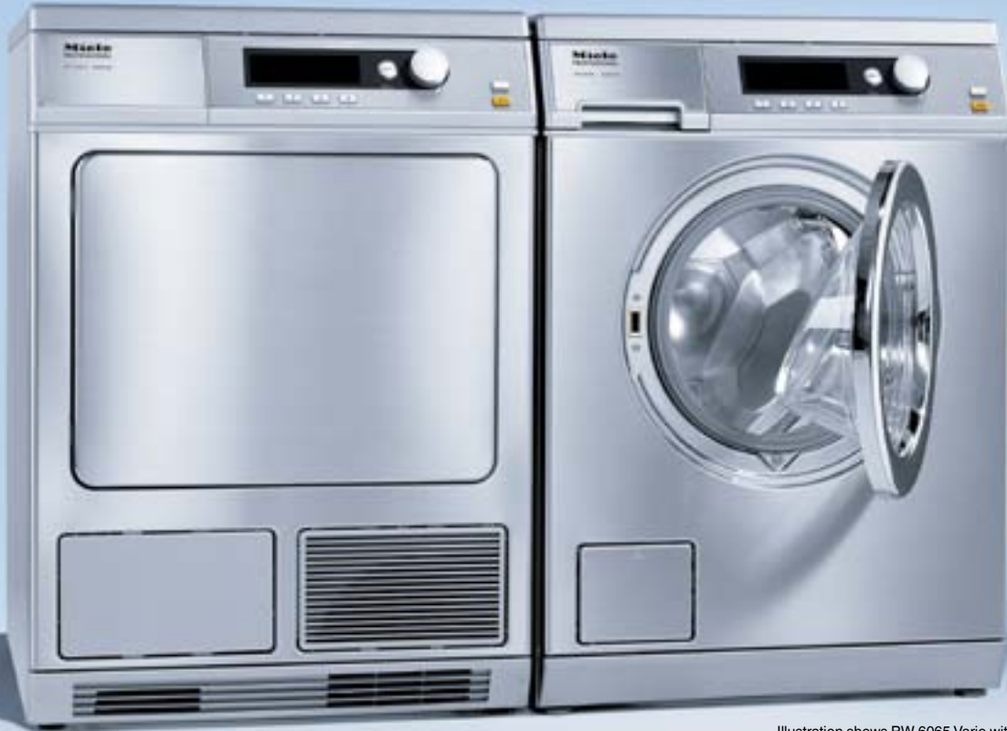
Illustration shows PW 6065 Vario with PT 7135 C Vario